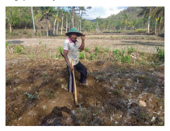
Photo 2. The impact of dry days in that year is in the long rain-free day in East Nusa Tenggara

the opposite. In July to December, there is an indication that La Niña phenomenon is weak, as shown by an increased number of days without rain. The ONI value is less than negative 0.5, which indicates that La Niña occurred in these months. Therefore, the series of dry days in that year was in the long rain-free day category and its impact is shown in Photo 2.