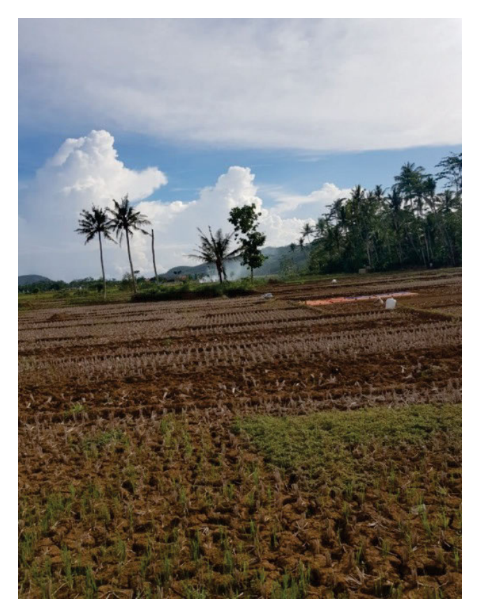
Photo 1. Extreme drought in East Sumba, East Nusa Tenggara Province

In the first 19 years of El Niño, the phenomenon occurred six times, while in the following 19 years seven times. One of these El Niño years still has a high rainfall value and it is classified as a weak El Niño. The results of this research show that the annual rainfall in the first six El Niño events is higher than the last six times. The research found that there was an accumulative decrease in total rainfall in the count of El Niño events, especially in the East Sumba region. The years 2002–2003 showed a higher rainfall value than other El Niño years. This could happen because El Niño these years was classified as weak with no ONI value greater than 1.5. Besides, El Niño began in mid-2002 and ended in early 2003, namely February, March, and April, whereas, other El Niño years generally occurred until the middle of the month or even the end of the month. Therefore, the rainfall in 2002–2003 reached more than 1000 mm.